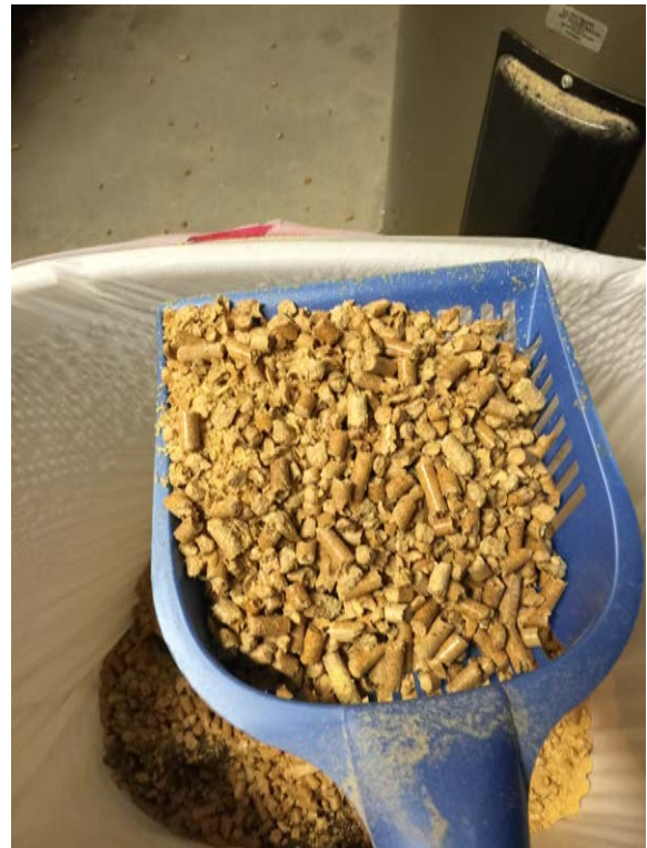
Use a standard scoop and sift Small portions over trash can. This gets rid of urine sawdust.