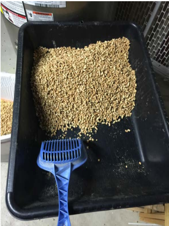
Push all litter to one side