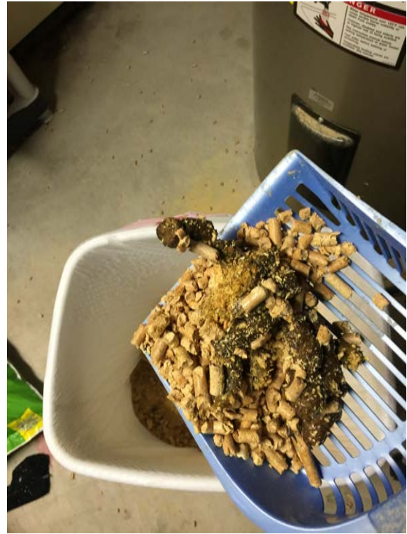
Dig around and remove feces